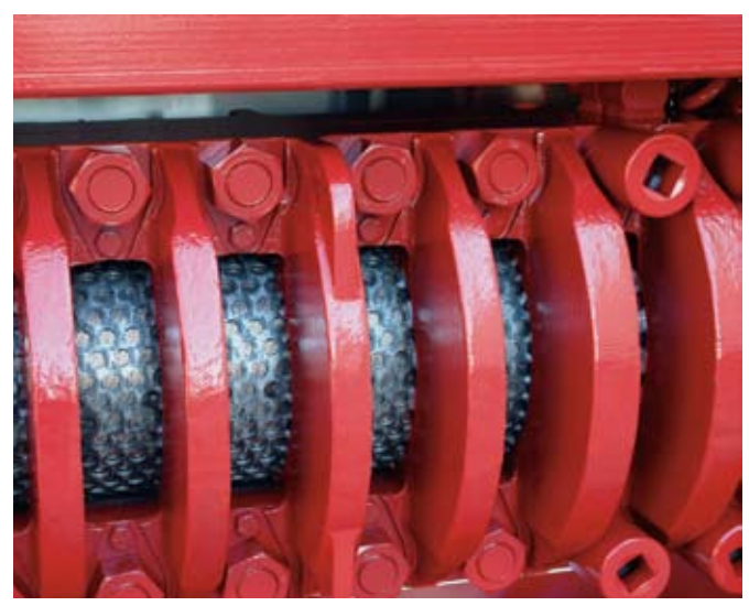
The Pressor for Hydrolyzed Feathers features screens that are easy to access and maintain.

Versatile new feather press is compact and easy to maintain. Efficiently adapts to your product and throughput specifications.